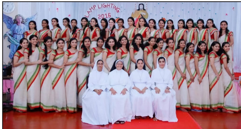
Second Batch Bsc. Nursing