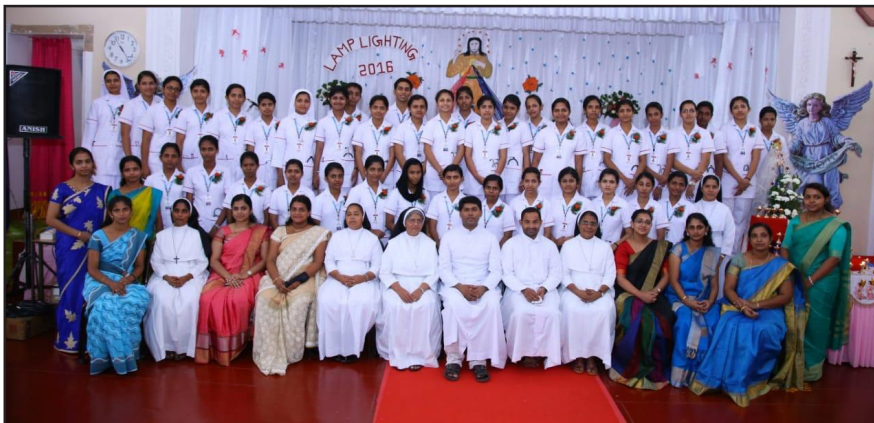
Third Batch Bsc. Nursing