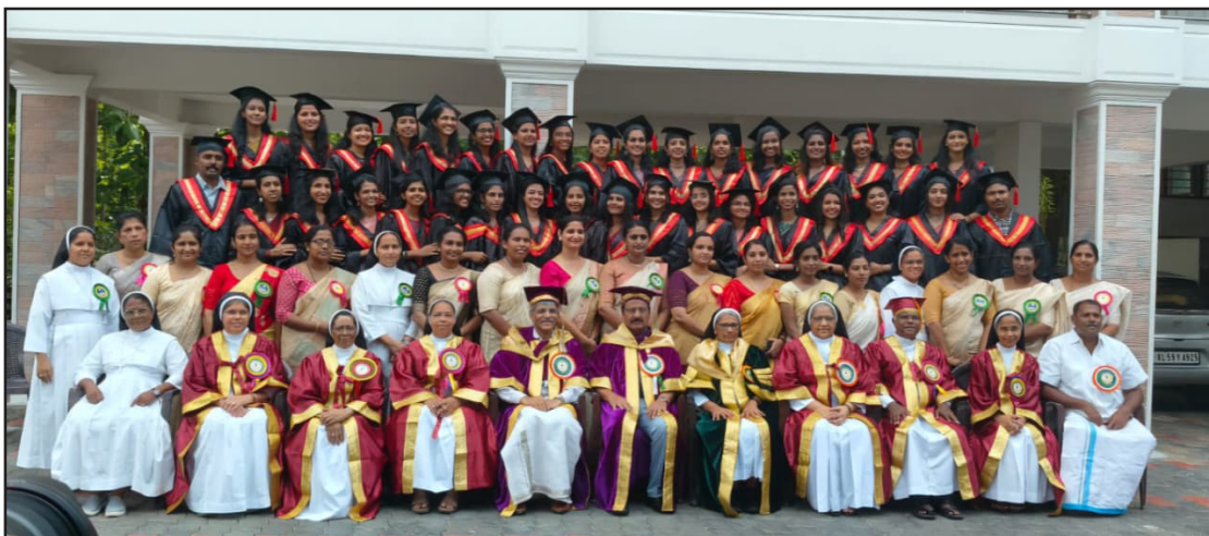
Our Recent Graduates