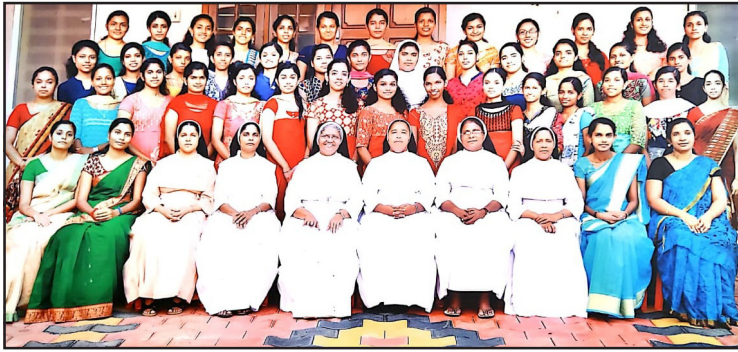
First Batch Bsc. Nursing