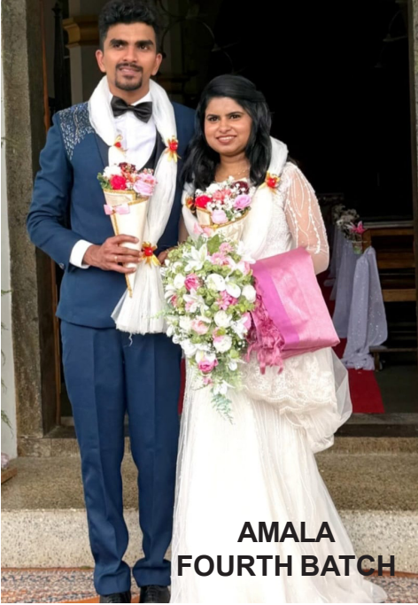
AMALA FOURTH BATCH