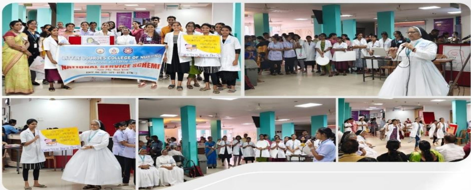
World mental health day celebrations by 6 th semester students