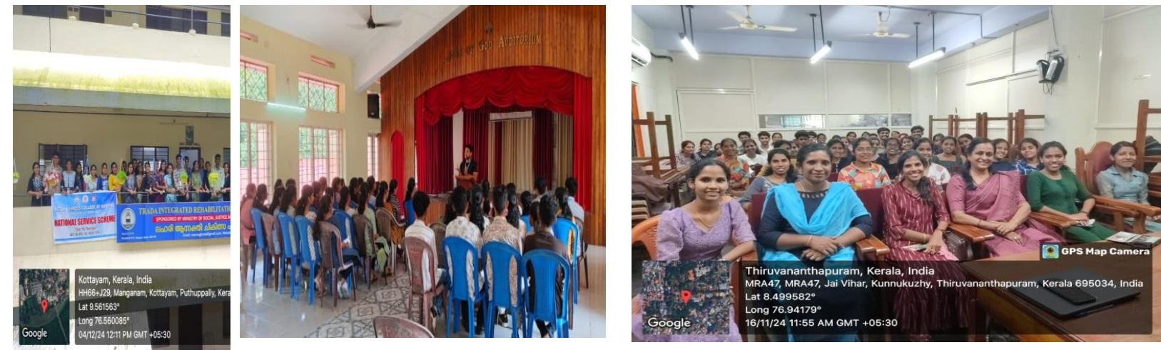
KNMC Visit by 6 th Semester students

Trada De-Addiction Centre Visit. Special School – St. John of God