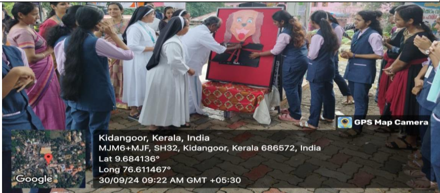
Picture: World Rabies day celebrations at Kidangoor Bus Bay