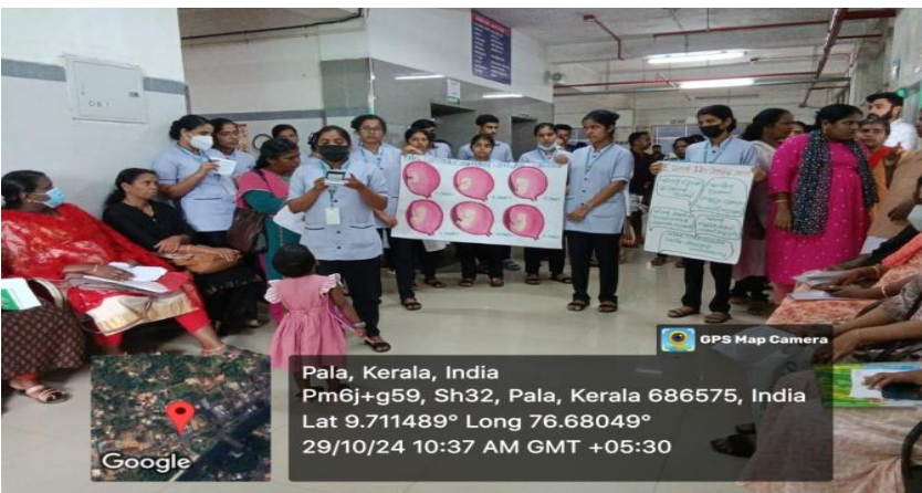
World fetus day programme

World Iodine Deficiency Day 2024 was observed with a special focus on raising awareness about the importance of iodine in preventing health issues, especially in children. Child Health Nursing Department organized an awareness program and exhibition in the pediatric ward of LLM Hospital and GH Pala, where VI Semester B.Sc Nrsing students educated parents and caregivers on the risks of iodine deficiency, such as developmental delays and thyroid problems. The event showcased informative materials, interactive sessions, and demonstrations about the benefits of iodine-rich foods and iodized salt. Free iodine supplements and educational pamphlets were distributed to families, ensuring they had access to necessary resources. The initiative successfully emphasized the need for iodine in the diet, contributing to better public health knowledge and preventative care.