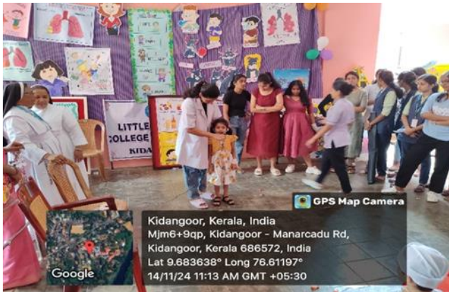
Childrens day programmes at LLM hospital OPD

Child health Nursing Dept of LLCON joyfully celebrated children’s day along with world pneumonia day on 14/11/2024 in the Paediatric OPD, emphasizing the importance of child health and value. World Pneumonia Day was marked with the theme "Every Breath Counts: Stop Pneumonia in Its Tracks." This theme underscores the critical importance of each breath and highlights the urgent need to combat pneumonia through timely detection, effective treatment, and preventive measures. The event featured with various fun activities of children and inspirational talks by experts. Prizes were awarded to the children as a compliment. Both observances serve as calls to action, urging global communities to prioritize children's rights and health. By listening to children and addressing health challenges like pneumonia, societies can work towards a healthier and more inclusive future.