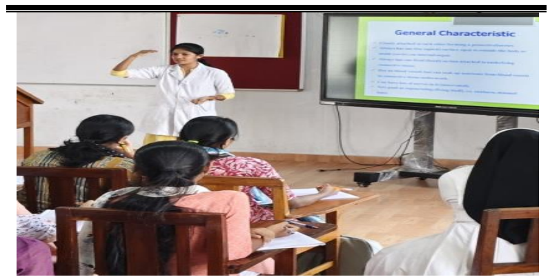
Image :In-service education programme